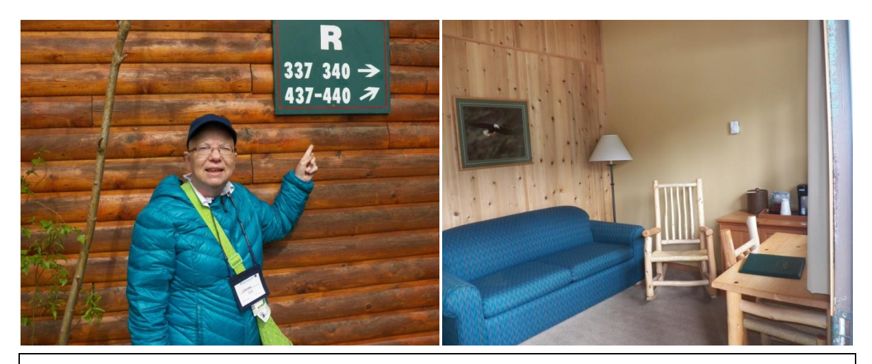
We stayed at McKinley Chalet Resort, a rustic lodge outside of Denali.