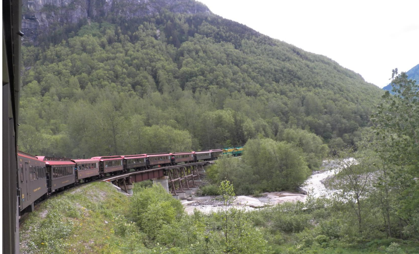
We have nearly reached Skagway at the bottom of the mountain. Alaska has such breathtaking scenery.